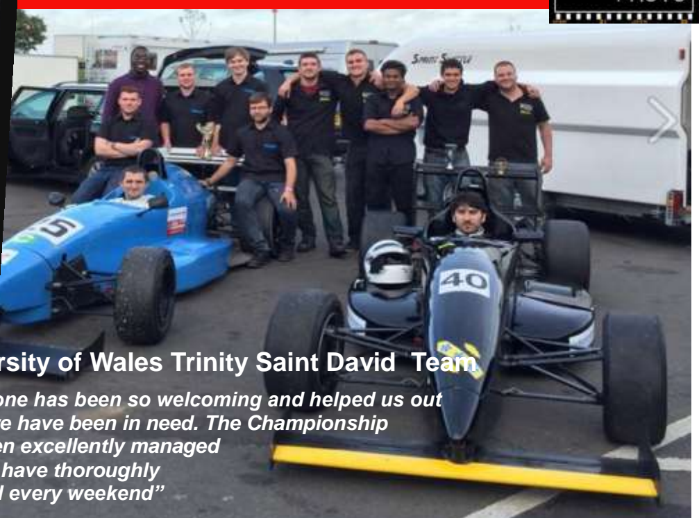
University of Wales Trinity Saint David Team

"Everyone has been so welcoming and helped us out when we have been in need. The Championship has been excellently managed and we have thoroughly enjoyed every weekend"